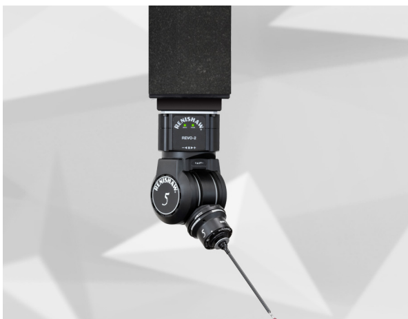
REVO-2 measuring head

In all, ATOM helps to streamline the REVO-2 manufacturing process, while still providing exceptional metrology performance.