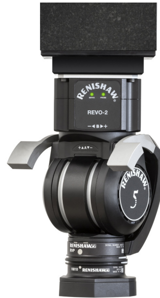
REVO-2 RVP vision probe with VM10 module