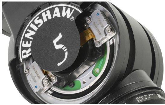
ATOM encoders on REVO-2 measuring head

The ATOM readheads are connected, via an analogue filter and analogue-to-digital converter (ADC), to REVO-2's electronics. ATOM, with its advanced highly-automated manufacturing processes that minimise process variability to assure the best quality and the shortest lead times, was chosen by REVO-2's design team as the most cost effective solution.