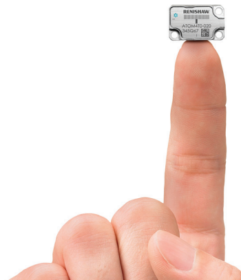
ATOM miniature encoder

ATOM is designed to support manufacturing and servicing operations with unrivalled technical support, streamlined installation and robust calibration procedures. The end result is reduced process cycle times, higher unit yields, greater efficiency and lower production costs. REVO and ATOM are leading products that are now combined in the powerful REVO-2.