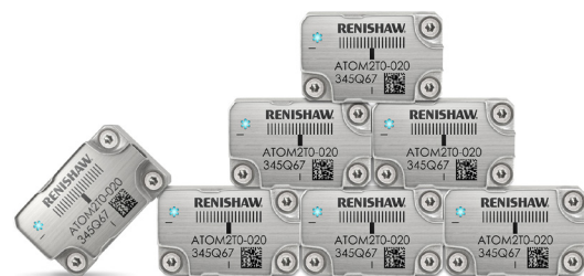
ATOM encoder readheads

ATOM systems provide two different methods for disc alignment, one electrical the other optical, and REVO-2's dual readhead set-up allows either type to be used. In this case, optical alignment was chosen to give a simple and highly repeatable way of setting disc runout – to help minimise process variability. This technique uses a microscope, connected to a camera, to monitor the movement of the alignment band as the disc is rotated. The disc is adjusted until the total alignment band movement is to within design specifications. It had previously taken up to an hour or more to complete this operation and align and lock the custom readhead in place. Now, ATOM is designed to allow readhead / scale mounting and alignment within a couple of minutes.